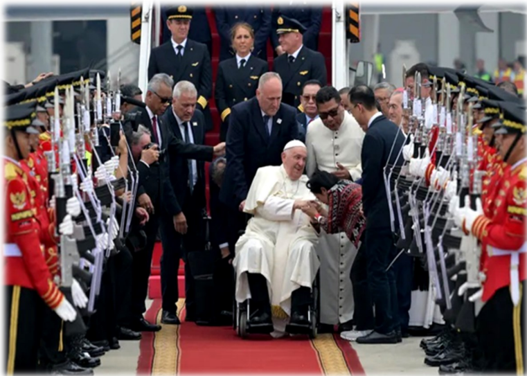
Pope Francis begins SE Asian tour September 2024

"It is time to pause in prayer, in order to receive the word of God, to pause like the Samaritan in the presence of a wounded brother or sister. Slow down, then, and pause!"