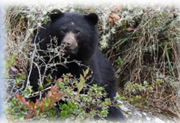
Spectacled bear