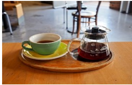
Have a cup!

Columbia is rich in natural resources. It is famous for its coffee, bananas and oil, but also sends overseas coal, gold, platinum and emeralds. The most controversial export, though, is illegal drugs. The Colombian government is trying to rid the country of the gangs, called cartels, that produce illegal drugs for sale around the world.