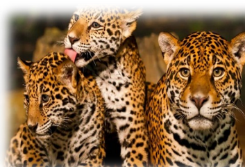
Colombian jaguars (The Animal Reader)