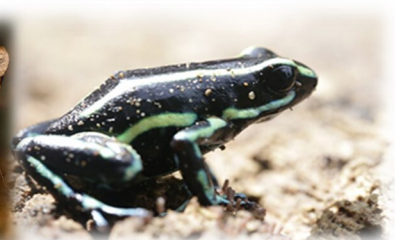
Poison dart frog