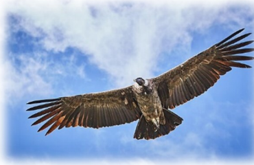
Andean condor

The Colombian jaguar can be found throughout the country in all types of geographical conditions. This is largely due to active conservation initiatives that protect the animals as well as farmers. The Andean condor is the national animal of Columbia and is the largest flying bird in the world. The spectacled bear is the only type of bear in Columbia, and sightings are rare. The dart frog is toxic to the touch and can cause skin irritation.